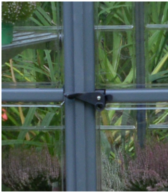
Lockable door handle