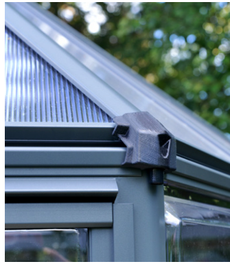
Built-in gutter system