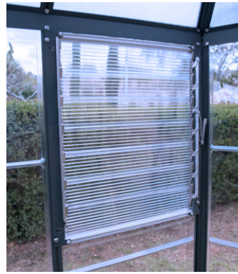
Side Louver Window included