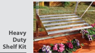
Heavy Duty Shelf Kit