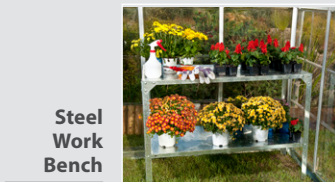
Steel Work Bench