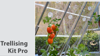
Trellising Kit Pro